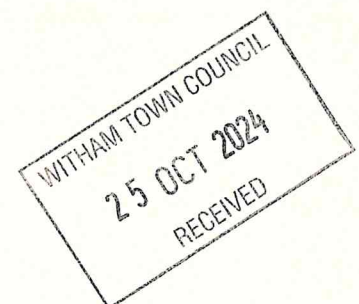
Rt Hon Priti Patel MP Member of Parliament for Witham